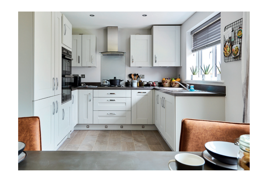
The Byford is a detached three-bedroom home ideally suited to modern living. Featuring a open plan kitchen/dining room forming the heart of the home.