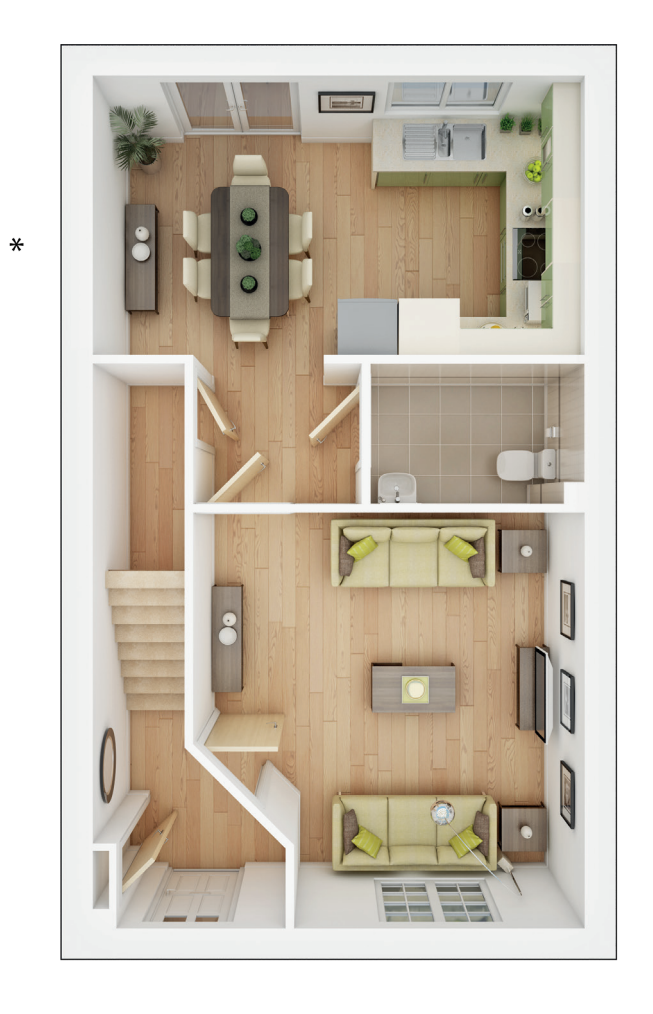
TOTAL 975 sq ft *Plot specific windows.