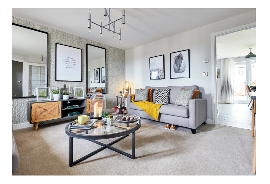
Spacious lounge, perfect for spending cosy nights in with the family