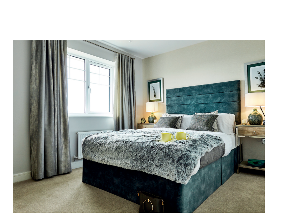
On the first floor, three spacious bedrooms including the en suite main bedroom can be found