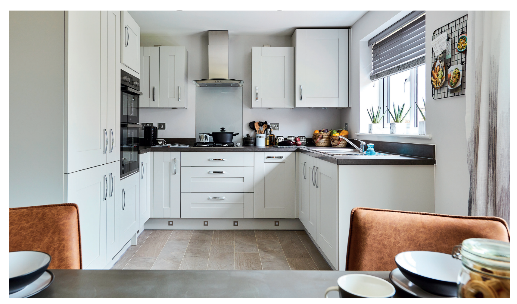
Typical Taylor Wimpey home shown