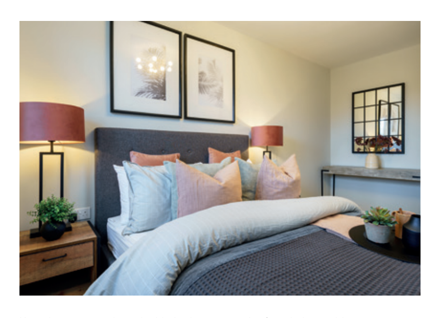
Upstairs, two spacious double bedrooms can be found along with the main bathroom