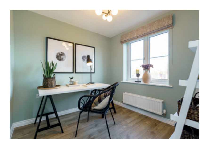
Separate study, ideal for home working