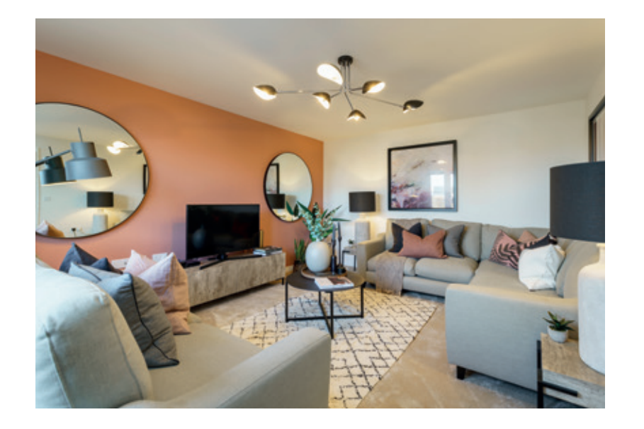
Spacious lounge, perfect for spending cosy nights in front of the television or entertaining guests