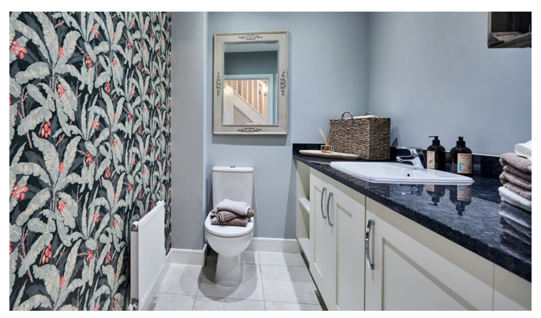
Typical Taylor Wimpey home shown